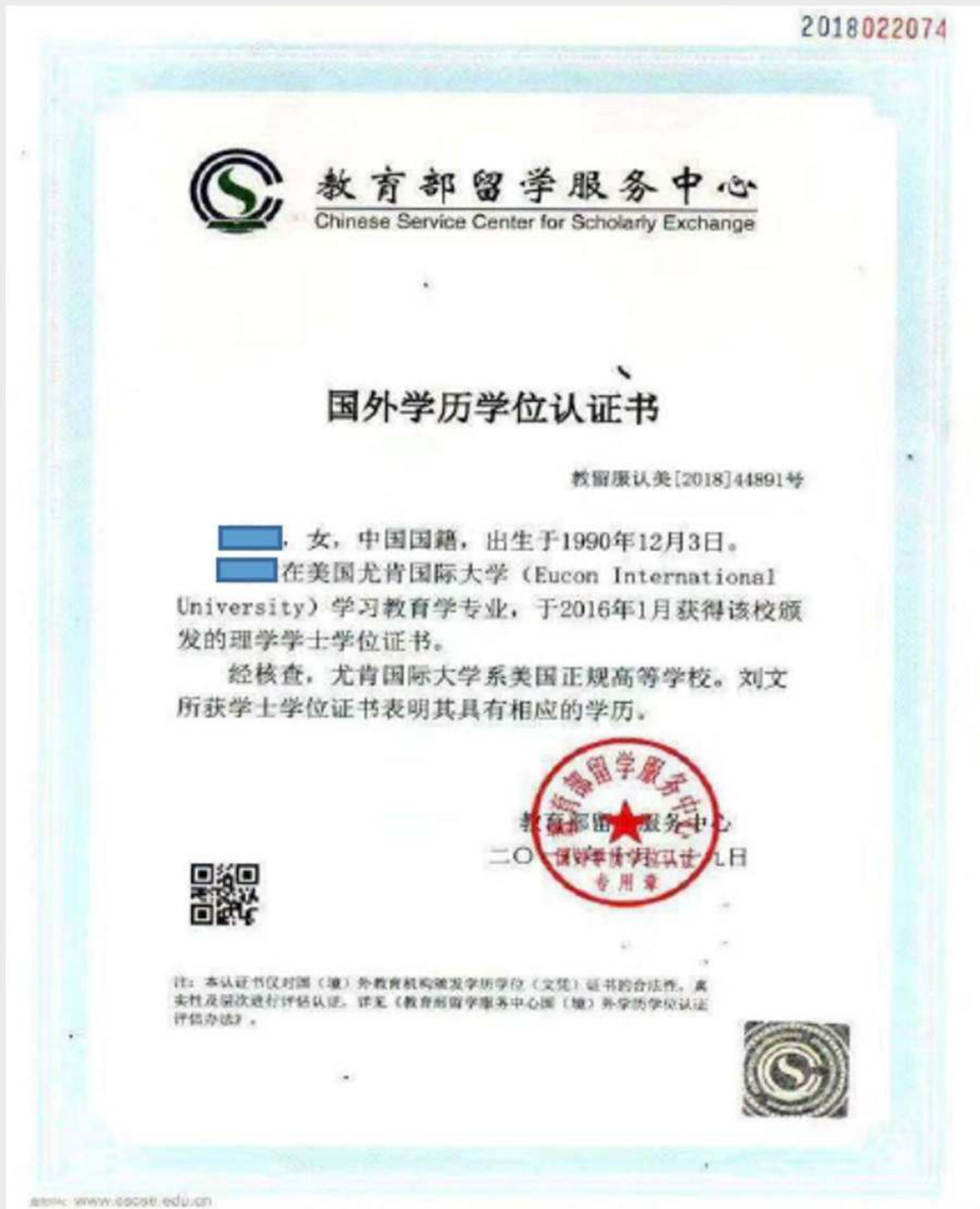
EUCON International University Bachelor's Degrees Recognized by China's Ministry of Education