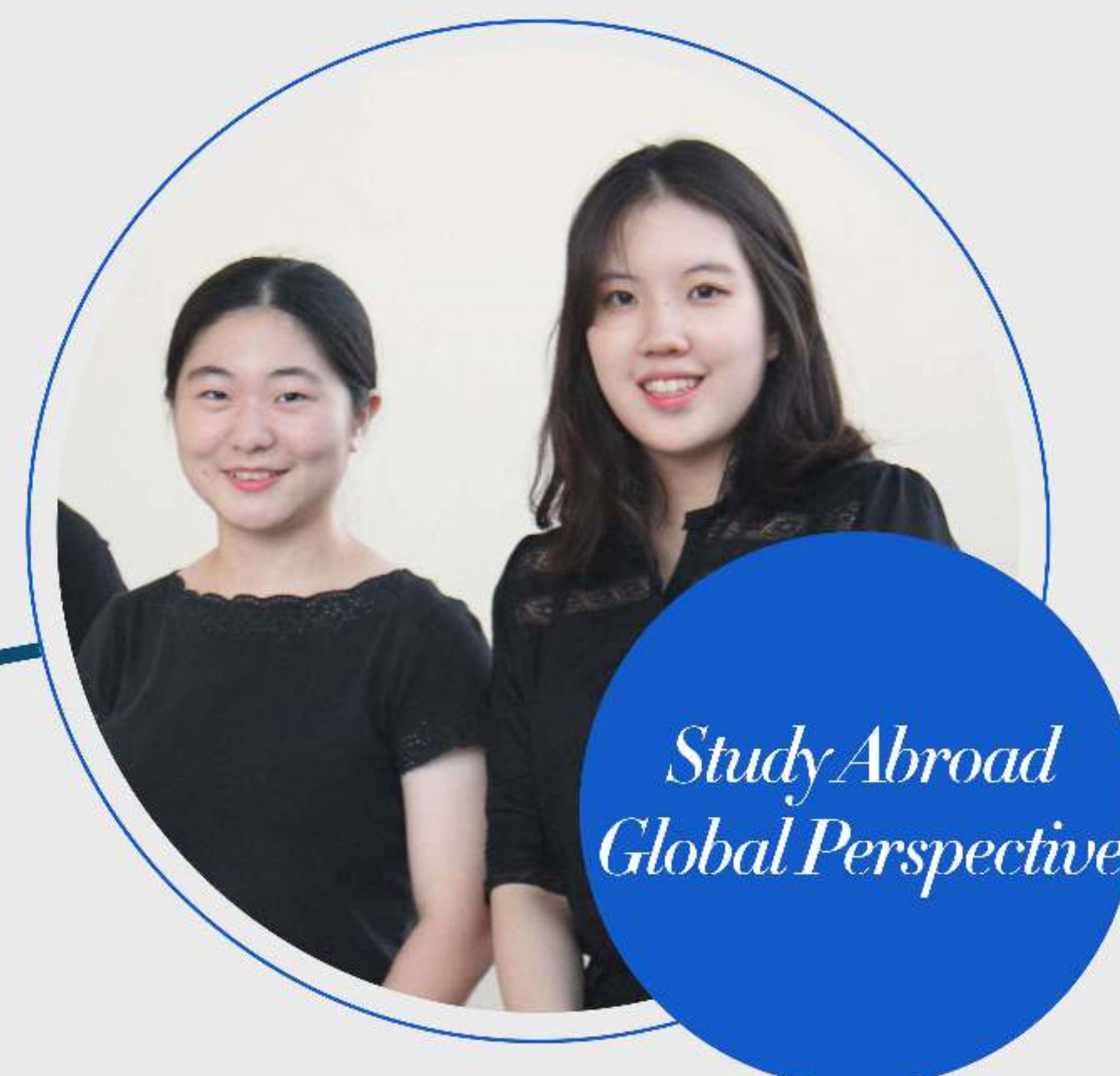
Study Abroad Global Perspective