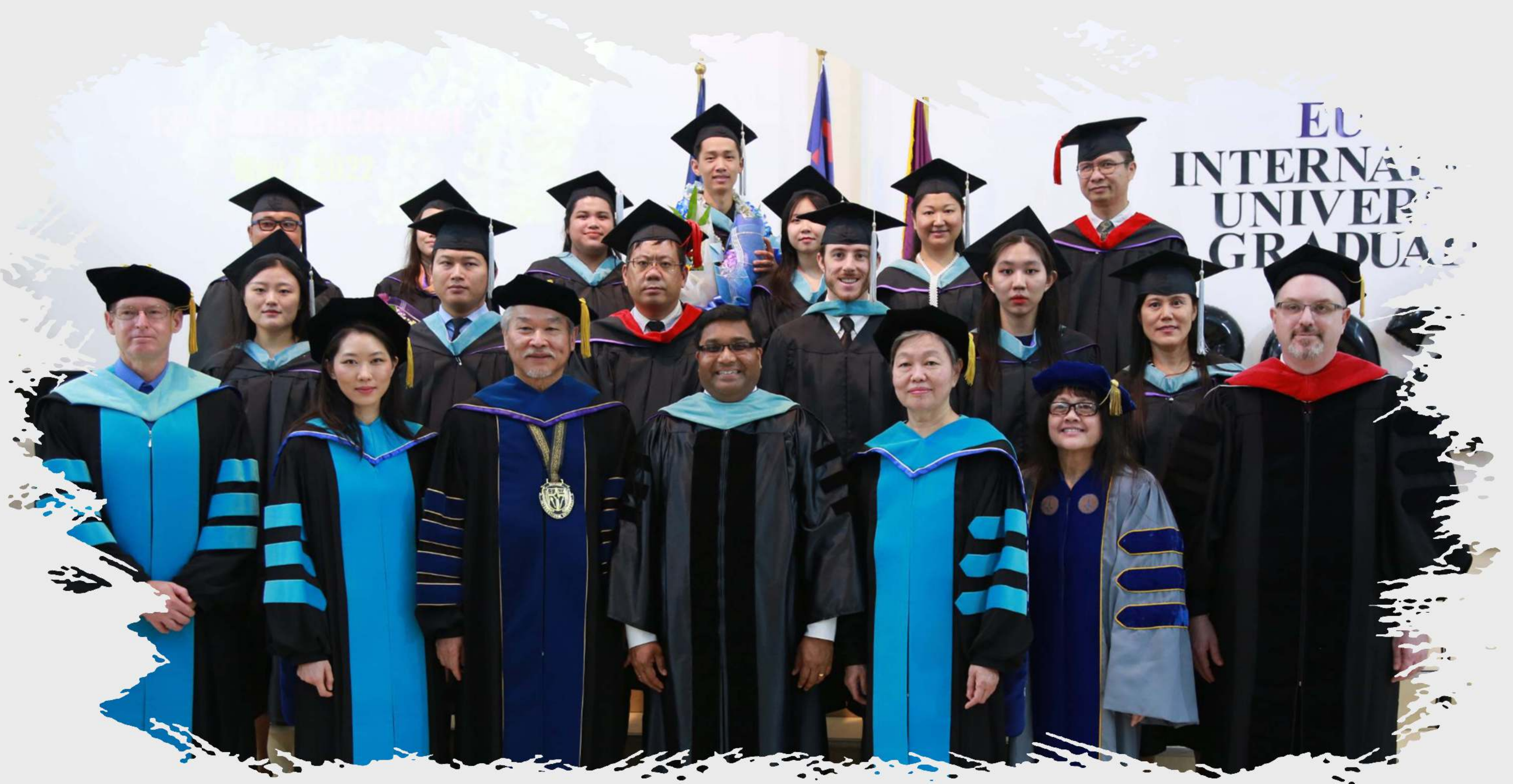
EUCON International University received academic accreditation from Hong Kong (awarded by the Hong Kong Council for Accreditation of Academic and Vocational Qualifications) on November 3, 2020.